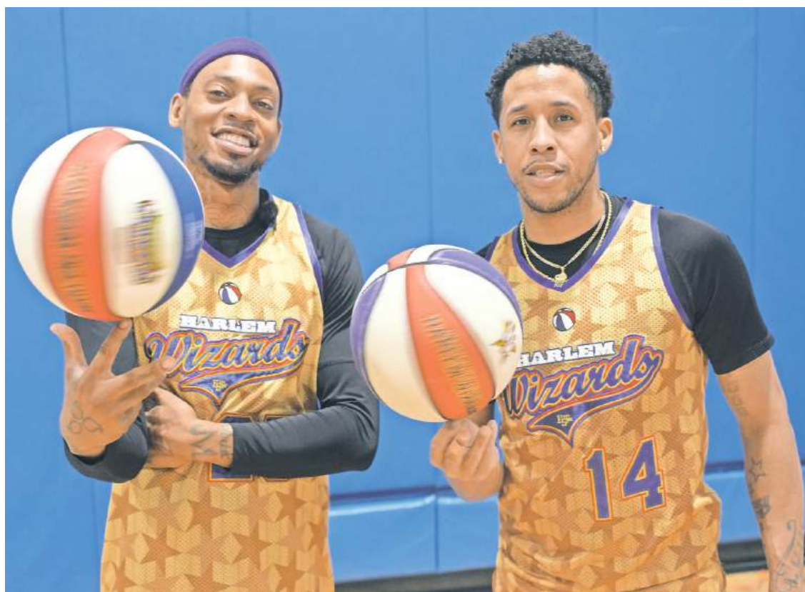
Showing the teachers a few new tricks, much to the amusement of their students — Hewlett High School