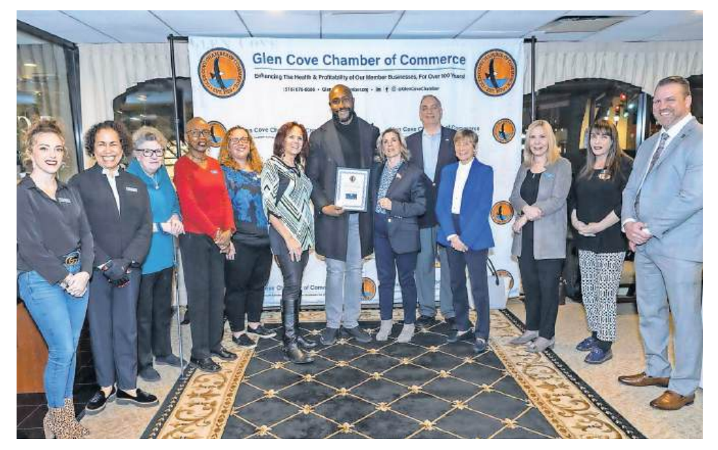
Oak & Vine was recognized for their scrumptious food at their restaurant located at 75 Cedar Swamp Rd, Glen Cove.

ausencia. Para Eleccion de la Bibliotecs y la Votacion Presupuesto se puede solicitar en las oficinas del Secretario del Distrito, de la Biblioteca Publica de Glen Cove, 4 Glen Cove Ave, Glen Cove, Nueva York. Tales solicitudes deben recibirse al