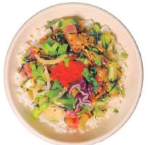
Tuna & Salmon Fan

Minced Ahi Tuna, Spicy Mayo, Masago, Scallion, Tempura Flakes