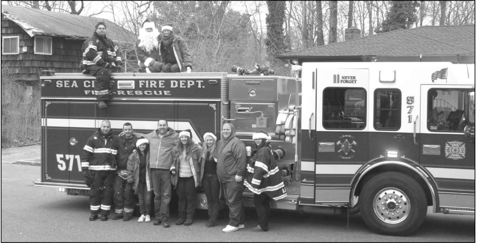
Several members of Sea Cliff Fire Department participated in the annual Santa Run on December 21st around Sea Cliff Village putting smiles of the faces of the young and the young at heart.