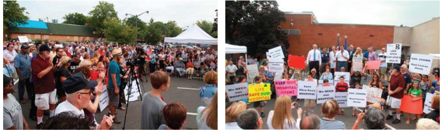
At Rallies numbers continue to grow protesting the Glen Cove Hospital officials plans to eliminate beds. Above over 500 residents gathered outside the Glen Cove Library.